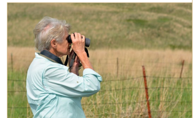
A new tradition at our annual Willa Cather Spring Conference is a guided walk with readings at the Willa Cather Memorial Prairie on National Prairie Day—the first Saturday in June.