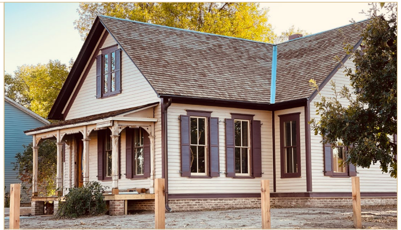
The long-awaited reopening of the Willa Cather Childhood Home will occur in December following completion of electrical upgrades, porch refurbishing, and recreation of the wood picket fence that was present during the Cather family's residency.

The project has reached 78% of its fundraising goal. If you would like to join the growing list of supporters, contributions may be mailed to the Willa Cather Foundation, 413 N. Webster St., Red Cloud, NE, 68970 or made online at WillaCather.org.