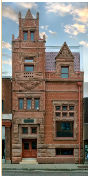
The newly restored Farmers and Merchants Bank was dedicated as the Willa Cather Museum in 1962.

As we mark the publication centenary of Willa Cather’s A Lost Lady , installation of a new permanent exhibit in the Farmers and Merchants Bank is underway. Making a Place: A Long History of Red Cloud invites visitors to explore the novel’s connections to Red Cloud through subjects that are both present and absent in Cather’s fiction. The exhibit will explore topics that include Pawnee culture; the lives of Silas and Lyra Garber—in life and as portrayed as Captain and Mrs. Forrester in A Lost Lady ; town-making and homesteading; banking and the Panic of 1893; and early preservation efforts led by the National Willa Cather Center’s founder, Mildred Bennett.