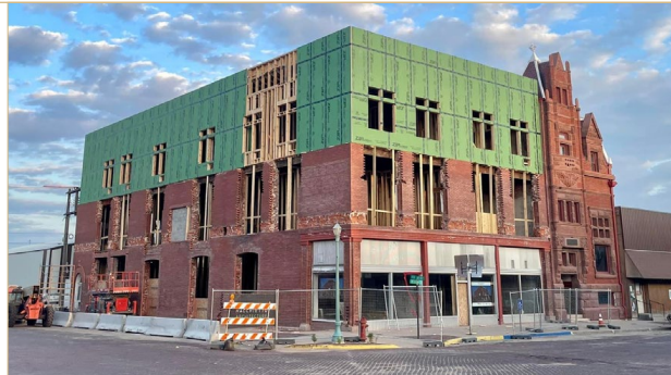
Construction on the long-awaited third floor began in September.

Rehabilitation of the Potter Block to make way for a boutique hotel and event venue is steadily advancing. A third floor that was lost to fire in 1961 has been reconstructed, interior framing is nearly complete, façade work is ongoing, and window installation is underway. Completion is slated for the latter half of 2024.