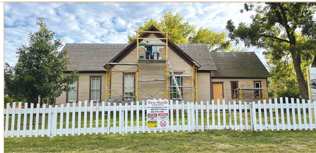
Exterior restoration in progress.

Prior to beginning construction, Willa Cather's bedroom was encapsulated to prevent construction dust and debris from soiling the room's original wallpaper. The attic has been insulated; its knee walls and ceilings have been enclosed with tongue-and-groove siding that matches both the profile of existing materials and the nailing pattern of materials that are missing from the attic. A climate control system has been installed to aid with conservation of the wallpaper and the well-being of visitors and staff, as the attic