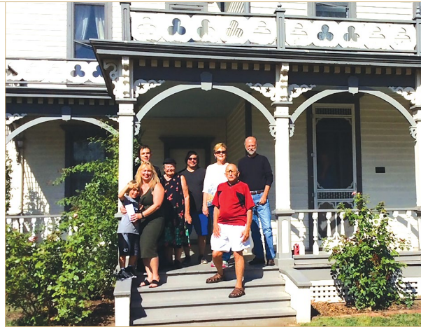
The family gathered in 2016 in Red Cloud, shown here on the J. L. Miner House porch.