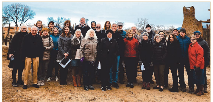
Attendees at our first Taos gathering, pictured here at Taos Pueblo.

To register, visit www.WillaCather.org/Events .