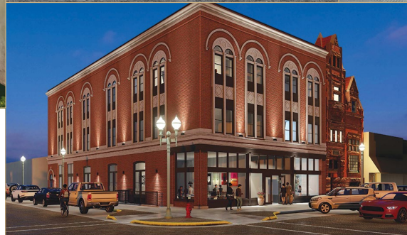
Building imagery: The Potter Building in the early 1900s, today, and as designed for rehabilitation.