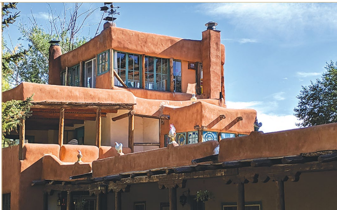
Participants will enjoy comfortable and historic lodging at the Mabel Dodge Luhan House

Rogers museum and more. Our time together will be hosted by the Mabel Dodge Luhan House, where Cather herself was a guest.