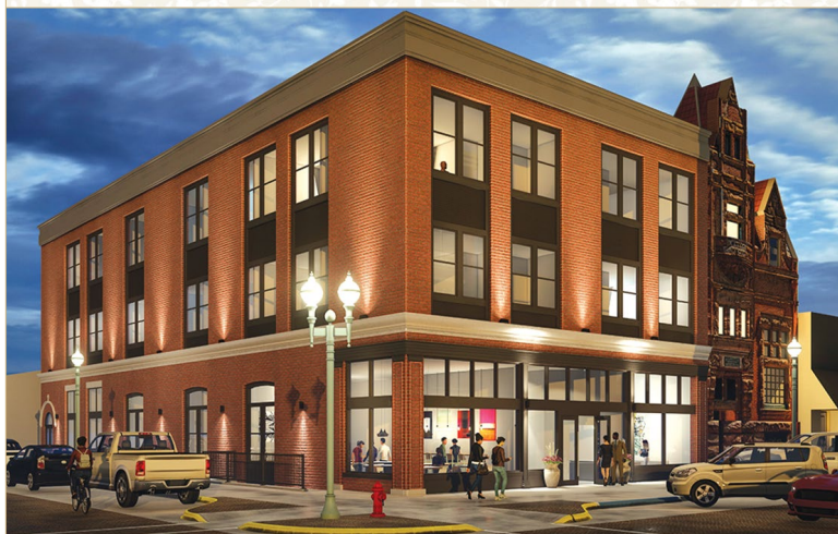
The hotel will be located next door to our Farmers and Merchants Bank, a site on the Cather tour.

Plans are underway to rehabilitate and adaptively reuse a downtown building for the creation of a twenty-six room boutique hotel. Located in the historic Potter-Wright building