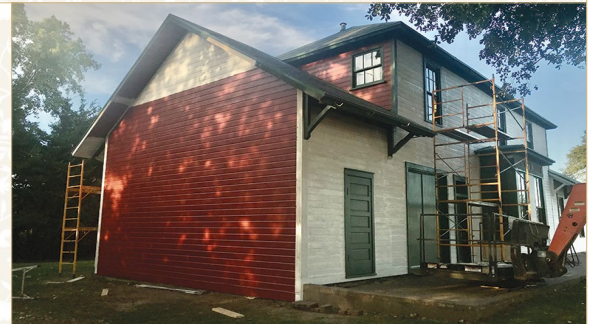
Work-in-progress on exterior painting at the Burlington Depot.

space to accommodate mechanical systems. The interior of the home was altered slightly to return the first floor layout to its period of significance.