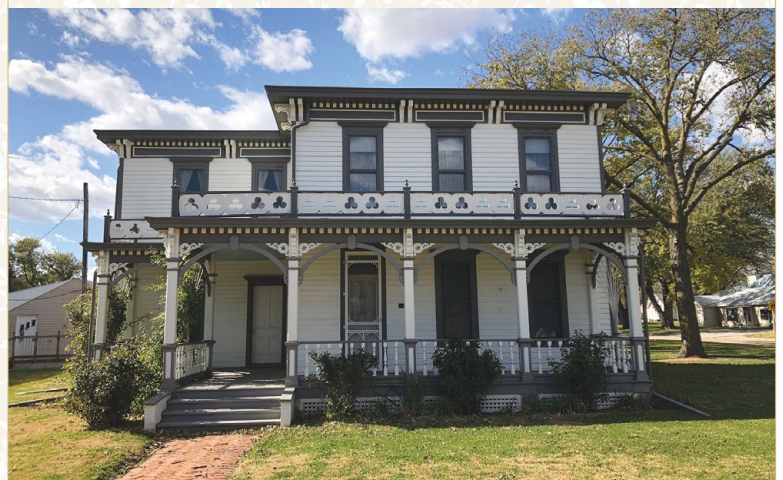
The J. L. Miner House, pictured today in all of its splendor.