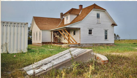
The Pavelka Farmstead following foundation restoration and stabilization.

A memorable setting from the final scenes of My Antonia , the Pavelka Farmstead had a new composite shake roof installed. An enclosed entryway was removed, and the porch was restored to its original open layout. The house was carefully moved from its foundation to allow for stabilization and excavation of a small crawl