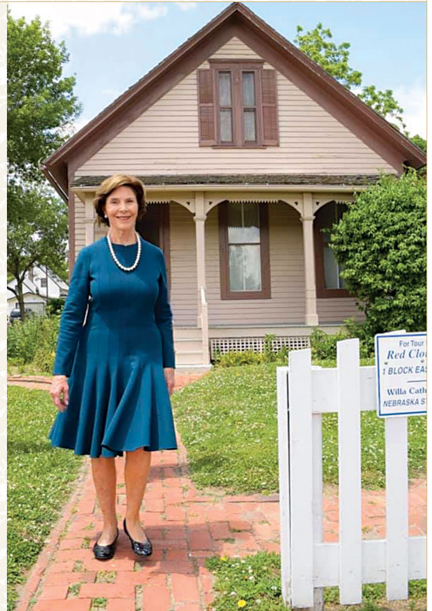
Mrs. Laura Bush visits the Willa Cather Childhood Home in 2017.