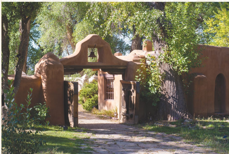
The Mabel Dodge Luhan House.