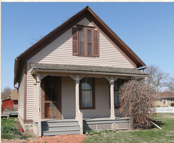
The iconic Willa Cather Childhood Home.

The National Willa Cather Center is one of forty-one recipients nationwide selected for a share of $12.6 million in Save America's Treasures grants administered by the National Park Service this year. The NPS, in partnership with the Institute of Museum and Library Services (IMLS), the National Endowment for the Arts (NEA), and the National Endowment for the Humanities (NEH), awarded these matching grants to support the preservation of nationally significant historic properties and collections through the Save America's Treasures program.