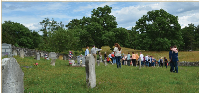
Seminar participants explore Gainesboro Cemetery, the final resting place of several Cather ancestors, just outside Winchester, Virginia.

During the week of June 17, over one hundred Cather scholars and enthusiasts from around the country and the world gathered for the 17th International Cather Seminar at Shenandoah University in Winchester, Virginia. Activities took place in and around Frederick County, Willa Cather's first home and where her extended family had settled since the 1730s. Through the lens of Willa Cather's final novel Sapphira and the Slave Girl and a thematic framework dubbed "Unsettling Cather: Differences and Dislocations," participants in this year's seminar contended with a host of complex issues. Foregrounded by the history of Cather's home state of Virginia, our group grappled with Cather's representations of race, illness, queer identity and gender, family history, and geography.