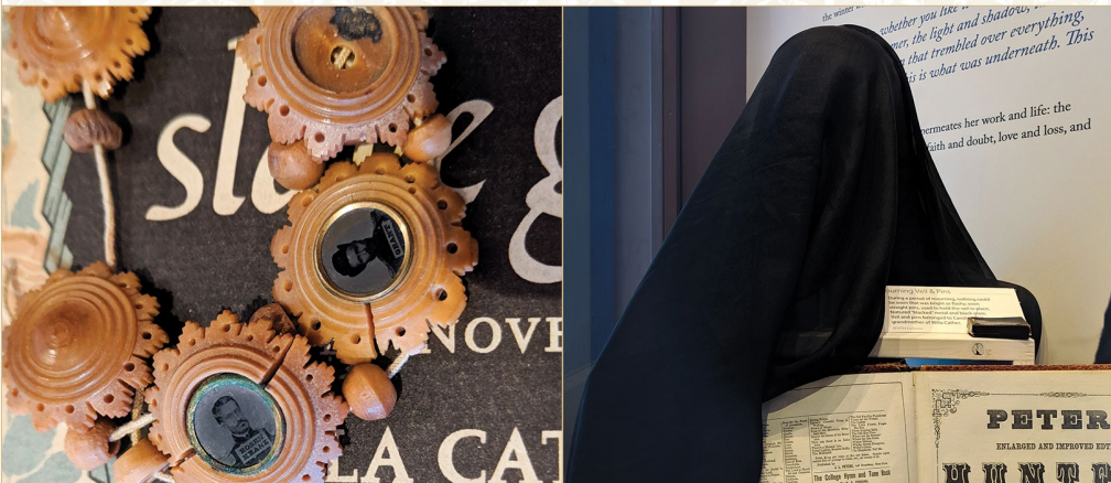
A display of Civil War items and mourning accoutrements that the Cather family brought to Nebraska.

As we prepared for the International Willa Cather Seminar in Virginia, we were interested in showing ways that the Cather's lives in Virginia continued to influence their lives in Nebraska. Located as they were near Winchester, Virginia, we anticipated that the Seminar would explore issues related to the tensions of the Civil War era, and so from the WCPM collection at the National Willa Cather Center, we selected this carved tagua nut Civil War commemorative bracelet, with ferrotypes of Ulysses S. Grant and William S. Rosenkrans (misspelled on this bracelet). Other examples of this type of piece also include a ferrotype of William Tecumseh Sherman, which may be the missing image in this bracelet.