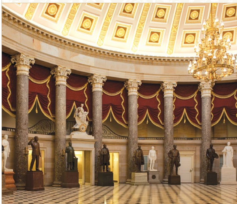
Willa Cather will one day be among the one hundred statues representing fifty states in the National Statuary Hall at the U.S. Capitol in Washington, D.C.

In addition to the symbolic Cather homecoming of properties and collections, it is our great pleasure to share that Willa Cather will be one of two Nebraskans to represent the state in the National Statuary Hall Collection at the U.S. Capitol in Washington, D.C. This not only signifies Cather's importance to Nebraska but her national literary stature.