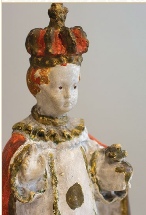
The Infant of Prague. OBJ-296-001. University of Nebraska–Lincoln Libraries Collection. Willa Cather Foundation Special Collections & Archives at the National Willa Cather Center