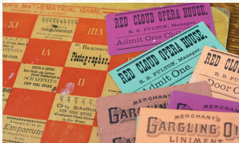
Hummer's Mathematical Game and Red Cloud Opera House tickets and coat check. OBJ-4-3560-2889 and 696. Willa Cather Pioneer Memorial Collection. Printed in 1888, Hummer's Mathematical Game features the advertisements of Red Cloud's top businesses. On the reverse, a checkerboard has the names of many Red Cloud children penciled across the spaces. On the reverse of the Opera House tickets are advertisements for Merchant's Gargling Oil, a ubiquitous advertiser around the country between 1833 and 1928.