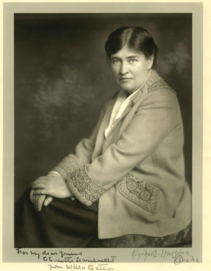
Willa Cather, 1921, photographed at Omaha’s Rinehart-Marsden studio. PHO-4-RG1951-204.