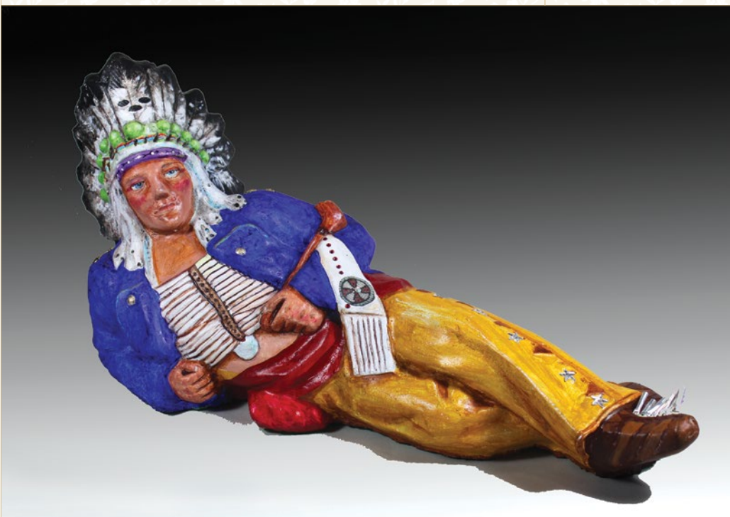
Juanita Pahdopony, Kitsch Me, I'm Indian! 2016; cast concrete, acrylic, aluminum cones, buckskin, rhinestones, paper, 9 x 27 x 8 inches

The public is invited to attend a reception celebrating the exhibit's opening on Saturday, April 13, at 6:00 p.m. The reception will be preceded by a reading and book signing by author Walter Echo-Hawk and followed by a theater, music, and storytelling production by Native American folklore troupe Mahenwahdose.