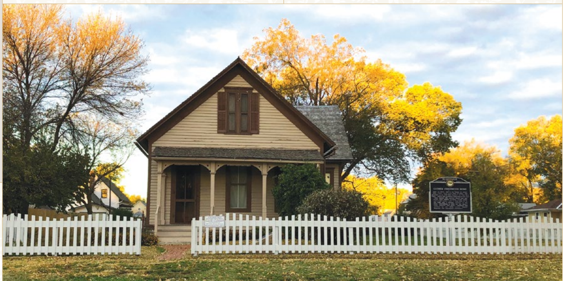
The iconic Willa Cather Childhood Home, also a National Historic Landmark, is one of six properties in Red Cloud and Webster County now owned by the Willa Cather Foundation.