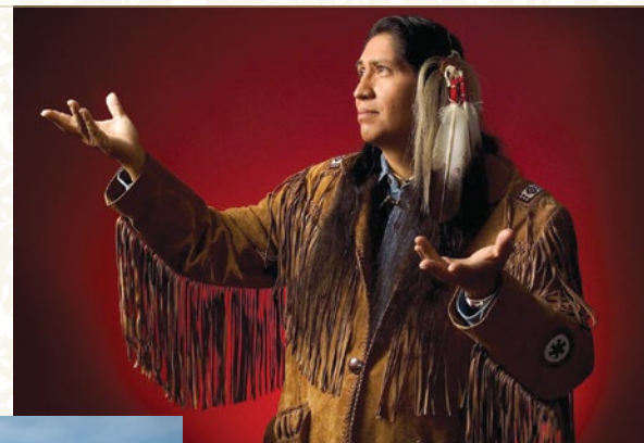
Mahenwahdose will perform at the Red Cloud Opera House on April 13.