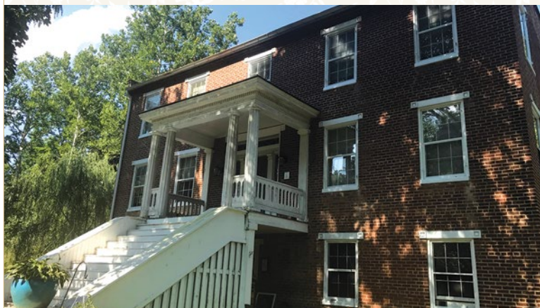
Willowshade, Willa Cather's first childhood home.

June 17–19, 2019, the International Cather Seminar returns to Cather's first home, Frederick County, Virginia, where her extended