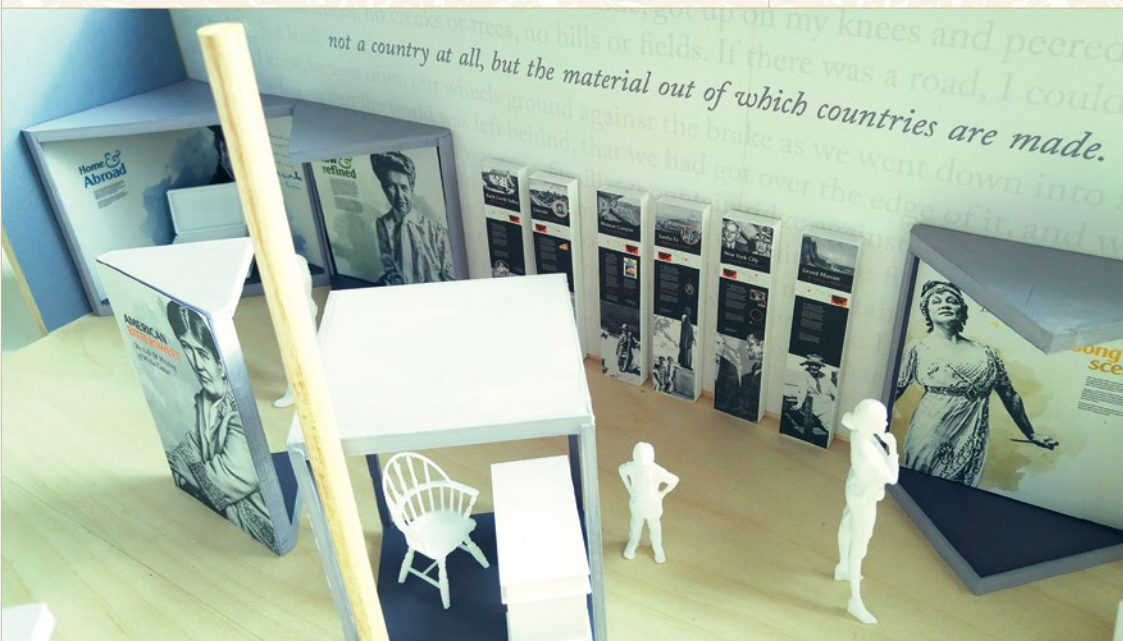
A conceptual model of the NWCC's permanent exhibit.