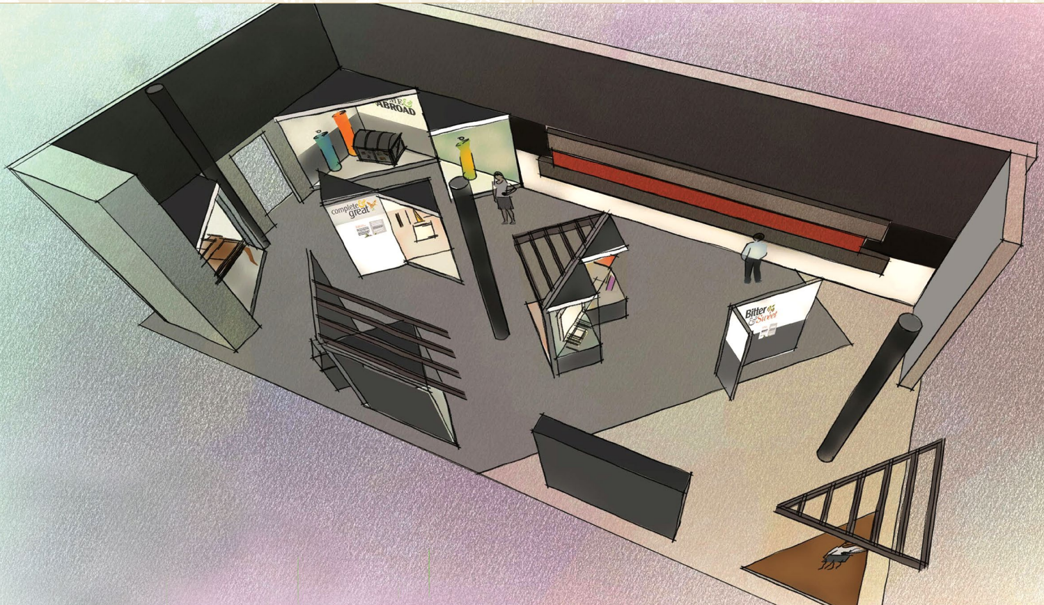
A preliminary sketch of the exhibit's layout.

The Institute of Museum and Library Services is the primary source of federal support for the nation's 123,000 libraries and 35,000 museums. Their mission is to inspire libraries and museums to advance innovation, lifelong learning, and cultural and civic engagement. Their grant making, policy development, and research help libraries and museums deliver valuable services that make it possible for communities and individuals to thrive. To learn more, visit www.imls.gov .