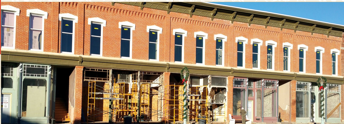
Front façade restoration begins on first floor of the historic Moon Block.