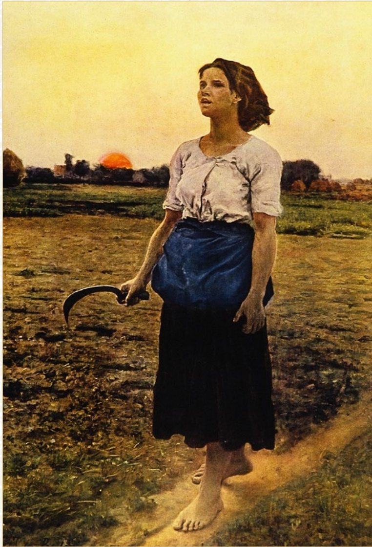
The Song of the Lark by Jules Breton