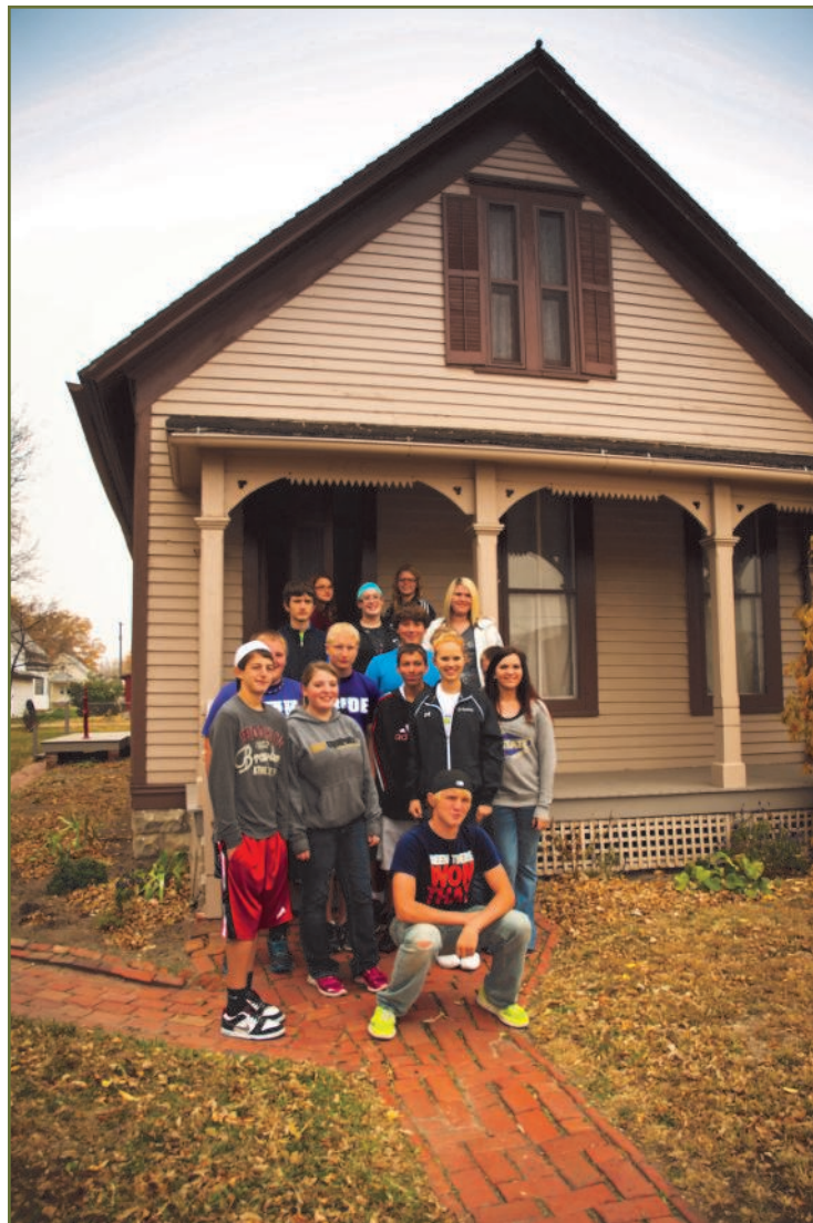
Our annual visitors, Sylvan-Lucas Unified School

As we approach 2013, Cather-related events will find us in Washington, D.C., to participate in a Cather panel discussion at the newly formed American Women Writers National Museum; in April we travel to New York to celebrate the publication of Cather's insightful and revealing correspondence. Back in Nebraska, we will continue the tradition of gathering friends and colleagues with our 58th annual Spring Conference, featuring a first-rate line-up of programs and entertainment. Finally, mid-June, we touch down in Flagstaff to share our stories and scholarship at the biannual International Cather Seminar. These travels and special events emerge under the commemorative umbrella of the 100th anniversary of O Pioneers! We cannot wait to celebrate this historic Cather achievement, and we hope you will join us along the way!