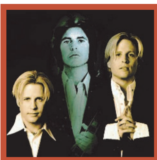
Matthew & Gunnar Nelson

Missoula Children's Theatre will return with Hansel & Gretel in the summer with