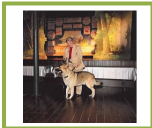
Rin Tin Tin XI performs at the 56th annual Willa Cather Spring Conference