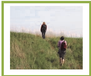
Prairie exploration at the 4th annual Prairie Writers' Workshop

next Spring Conference, scheduled for May 31 – June 2, 2012. Visit www.WillaCather.org for more information about our upcoming events.