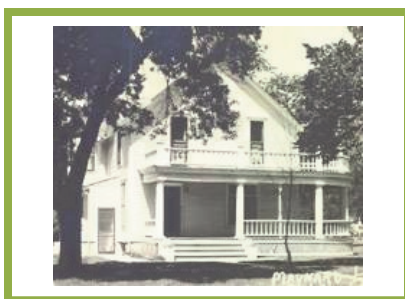
Cather Second Home at 541 North Seward Street in Red Cloud

A virtual housewarming party is planned for later this year in order to supply the home with linens, china, and period-appropriate furnishings. Anyone wishing to make an in-kind gift can contact the Foundation toll-free at 866-731-7304