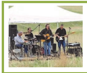
Pilgrim Classic Country performance at "Music on the Cather Prairie"