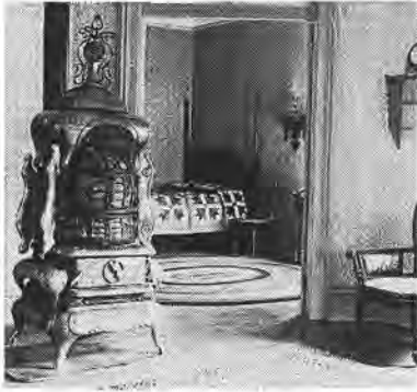
"She (Thea) saw everything clearly in the red light from the isinglass sides of the hard-coal burner—the nickel trimmings on the stove itself, (the pictures on the wall, which she thought very beautiful), the flowers on the Brussels carpet . . ." (THE SONG OF THE LARK). Beyond the doorway is the parents' bedroom.

(who was 98 at the time). Much of the furniture came from the estate of Elsie Cather, Willa's sister. The House was opened for visitors in 1967.