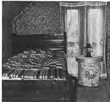
"The ceiling was so low . . . and it sloped down on either side. There was only one window and it was a double one and went to the floor . . ." (SONG OF THE LARK) The wallpaper that Willa Cather put on her tiny attic room still remains.

Willa Cather's backgrounds and settings have a personality of their own. Seeing the House, going into it, is like visiting an old friend for people who come from all over the world. Standing in the long attic just outside the open door of Willa Cather's room, hearing the rain's soft patter on the fragrant cedar shingles just overhead, one can easily feel, as Thea did, that "the sprawling old house had gathered them all in, like a hen, and had settled down over its brood. They were all warm in her father's house." (THE SONG OF THE LARK)