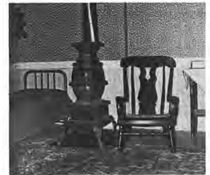
"It was a queer place to be having coffee.. a hideous, cluttered room.. In another corner was the wooden lounge with a thin mattress and a red calico spread which was Grandma's bed. Beside it was her wooden rocking chair.." ("Old Mrs. Harris")