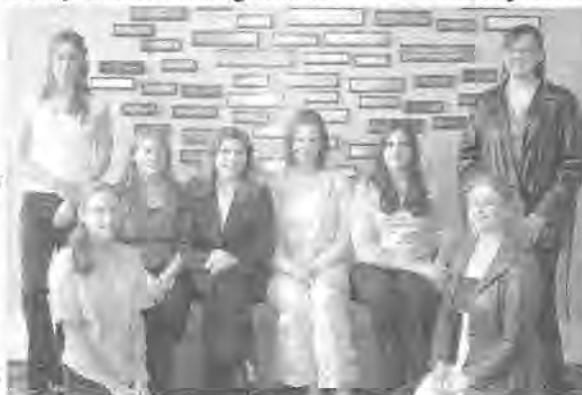
Participants pose in front of the Upper Lobby Donor Wall.

The Cotter-Cather Emerging Writers of the Heartland Symposium is slated to become an annual fall event.