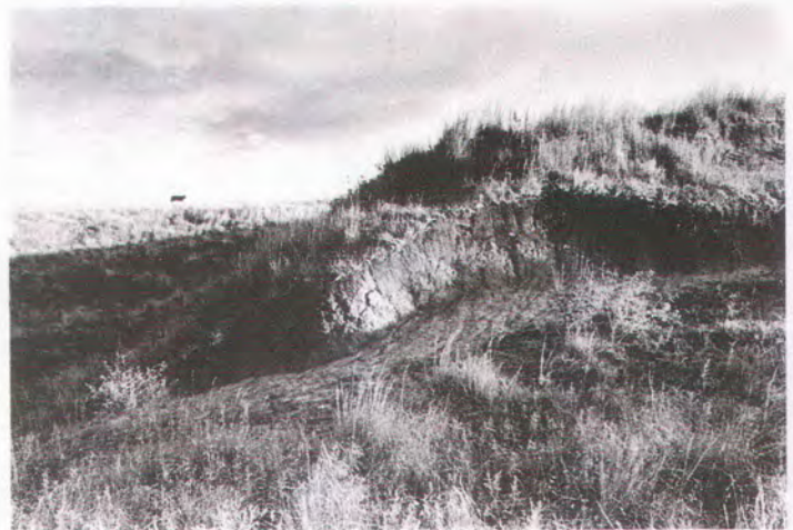
The Willa Cather Memorial Prairie, near Red Cloud, Nebraska, 1974.

In June of 2006, the Cather Foundation will take part in a re-dedication of the Willa Cather Memorial Prairie as it is ceremoniously transferred from the Nature Conservancy to the Cather Foundation, along with a generous endowment, to provide for the continued maintenance of the land. The 608-acre tract of land, five miles from Red Cloud on the Kansas border, has been under the care of the Nature Conservancy for over thirty years. According to the Nature Conservancy's fall 2005 Nebraska Update , the "Prairie was purchased by the Conservancy in 1974 as much for its cultural value as for its ecological value."