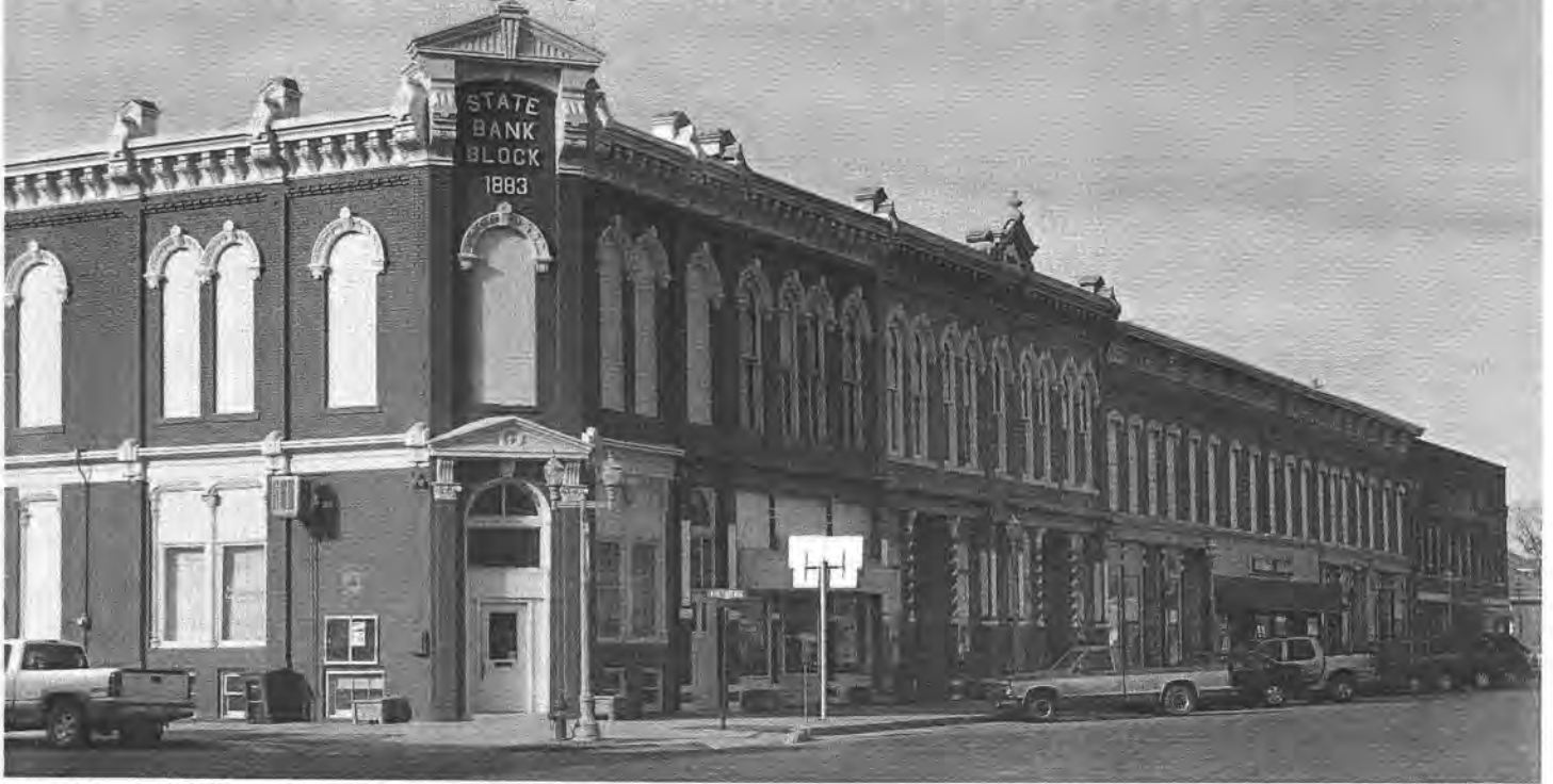
Webster Street in Red Cloud.

The 51 st annual Willa Cather Spring Conference, June 1 through June 3, will feature Shadows on the Rock . This is a particularly propitious choice for the conference as the Scholarly Edition of Shadows on the Rock has recently been published. The theme of the conference is “Cather’s International Connections,” a fitting topic as Shadows on the Rock , with its strong French-Canadian flavor, provides a wonderful primer for the upcoming 2007 Cather International Seminar to be held in France.