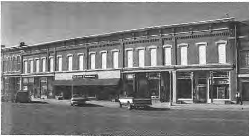
The Moon Block.

The Cather Foundation Board of Governors, at its January meeting, voted to begin the process of restoring the Historic Moon Block on Webster Street in Red Cloud. Owned by the Cather Foundation, the Moon Block is on the list of National Historic Sites.