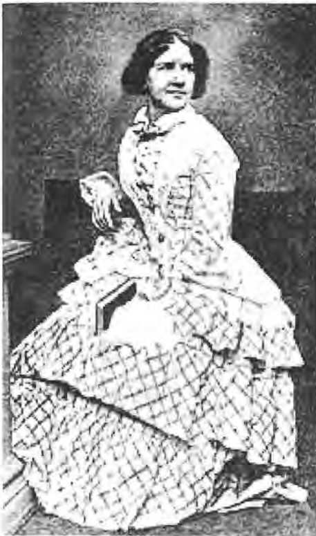
Jenny Lind.

“of the greatest coloratura sopranos of the nineteenth century” (Pleasant 191) on their American tours—a fact of which Cather is clearly aware. In The Song of the Lark , Cather writes that Thomas is awakened from his “adolescent drowsiness” by “two voices, by two women who sang in New York in 1851,—Jenny Lind and Henriette Sontag. They are the first great artists he has ever heard, and he never forgets his debt to them. . . .