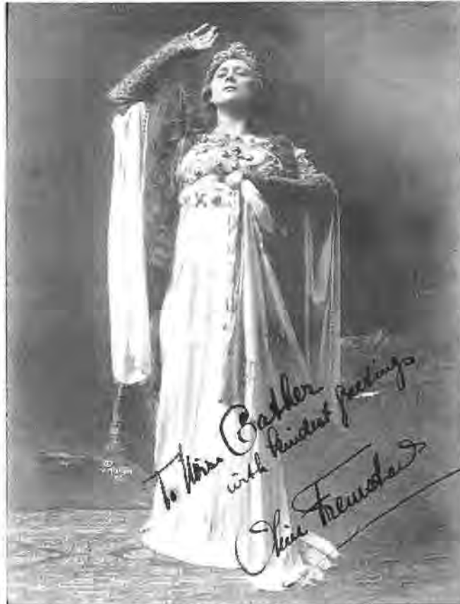
Photograph of Olive Fremstad, inscribed: "To Willa Cather with kindest feelings."