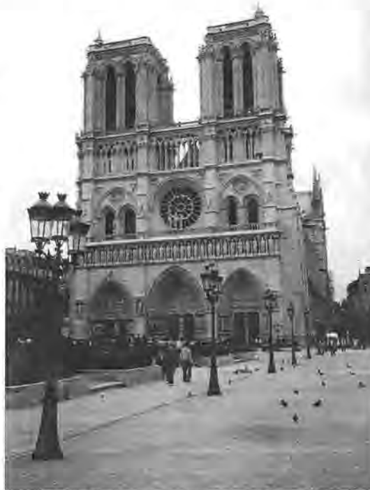
Notre-Dame Cathedral, Paris.

Vital to Shadows , central to several other Cather works, and representative of the medieval worldview are vertical images such as towers and the theme of sanctuary, both introduced in