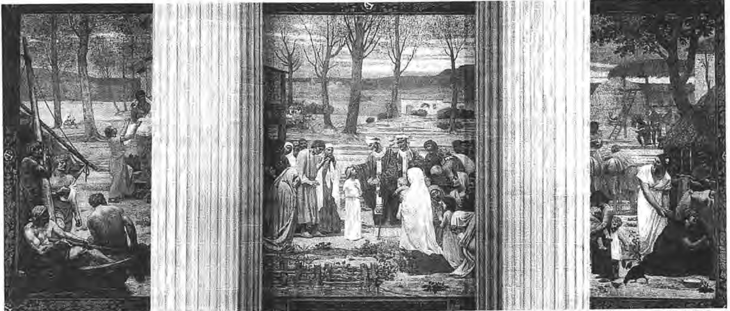
St. Genevieve meets two bishops, St. Germain and St. Loup. This is the first triptych in the Puvis de Chavannes murals in Paris's Pantheon to which Cather was indebted in Death Comes for the Archbishop .