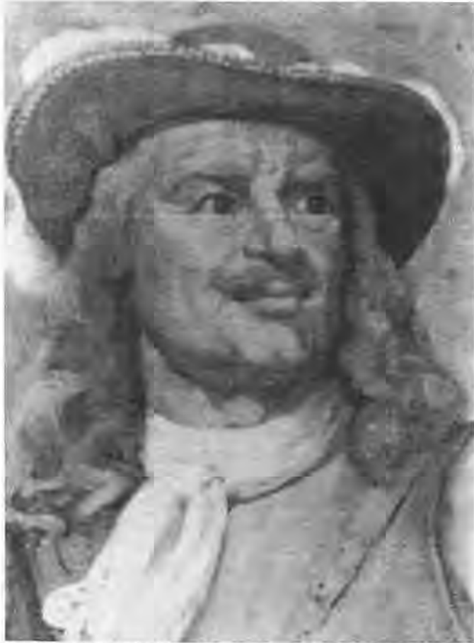
Detail from the portrait of Count Frontenac hanging in the lobby of the Chateau Frontenac since the early twentieth century. Cather would have seen this portrait during her stays at the hotel.