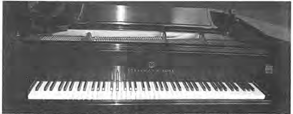
Recently donated Steinway piano at the Red Cloud Opera House.