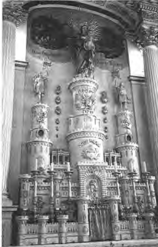
The main altar of Notre Dame des Victoires, which Cecile Auclair imagines as a duplicate of the Kingdom of Heaven.

Sarah Orne Jewett enabled Cather to write lovingly about Nebraska off and on for a decade, seeing it through the prism of literature and the arts; although in the progression of novels from O Pioneers! to A Lost Lady , bitter social criticism increasingly weighed against and eventually overwhelmed the lyric adventures of childhood on the prairie. By the mid-twenties, in The Professor's House , Cather was no longer writing provincially. She was examining the malaise of a secular, postwar society defined by business and science through a protagonist (much like herself) grappling with survival when "everything around him [ ] seemed insupportable," when life's voyage seemed blocked from the "bright rings" of the stars (148-49). This novel marks a definite break in Cather's fiction from her immediate personal past to the historical past, from the prairies to the mesa-strewn deserts, the antebellum South, and the rocks of Quebec, Grand Manan, and Avignon. Even when she returned intermittently to Nebraska in her writing, the issues seemed less