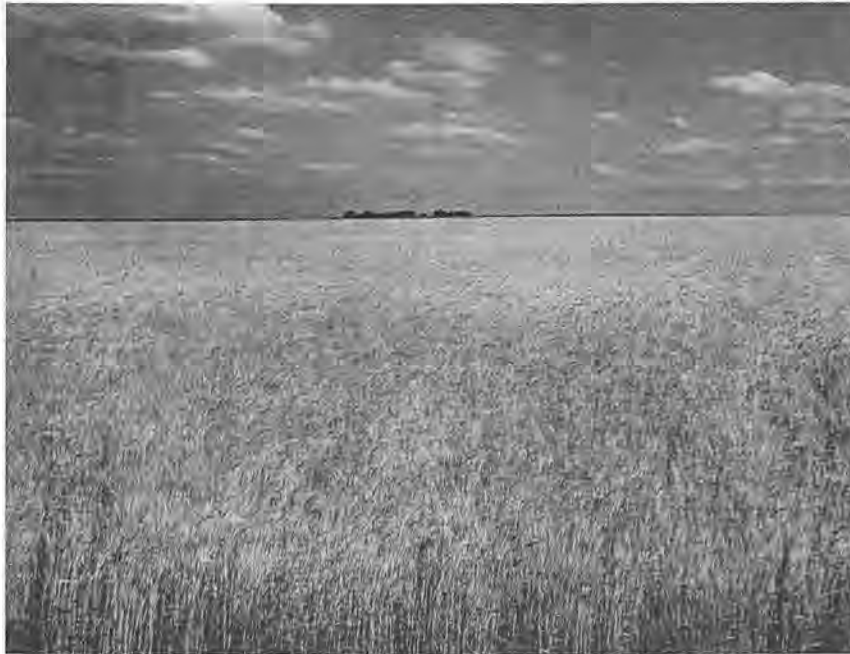
"[T]he open face of the country.. seems to rise a little to meet the sun. The air and the earth are curiously mated and intrmingled, as if the one were the breath of the other."— O Pioneers!

While critics generally acknowledge that Cather borrowed her epigraph to O Pioneers! from Adam Mickiewicz's epic poem Pan Tadeusz or The Last Foray in Lithuania , no extensive study exists of why Cather chose this particular epigraph, how she would have known the Polish national epic, or how the work is reflected in or may have influenced the writing of her first Nebraska novel. While the exact connection of Cather to Mickiewicz and his work may never be known, Cather's conscious choice of this epigraph signals that she conceived of O Pioneers! as an extension