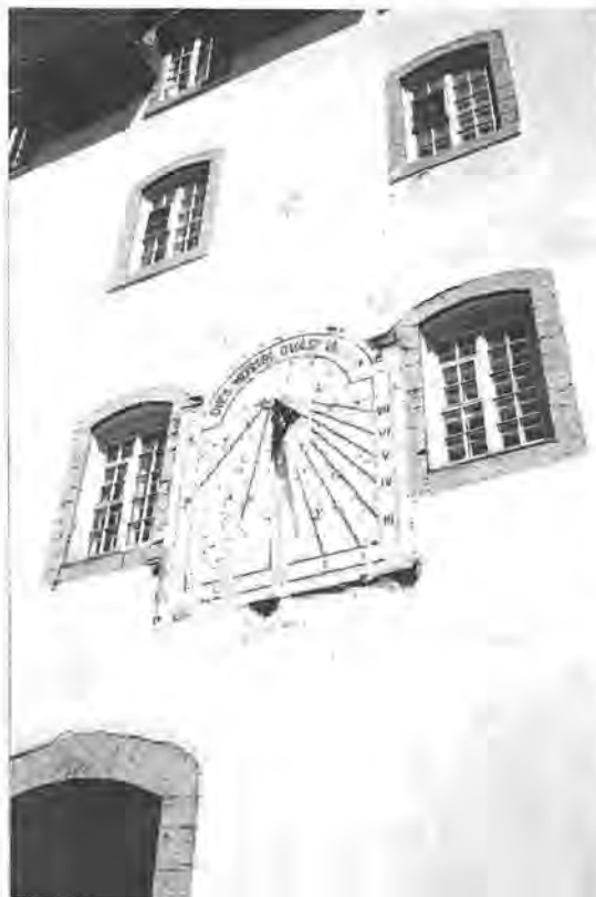
The sundial in the Quebec Seminary courtyard with the inscription Dies nostri quasi umbra, “Our days as if a shadow” (1 Chronicles 29:15), echoed in the title Shadows on the Rock.

zone in which conception and a new birth take place” (21). Both Esmeralda and Quasimodo are thrust into such depths—he on the pillory and she, later, in the pit awaiting execution for murder and witchcraft. Quasimodo’s sudden transformation occurs when he rescues the girl from the porch of the cathedral as she does penance. He carries her inside, shouts, “Sanctuary!” and “at that moment Quasimodo was really beautiful” (347).