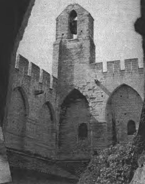
Palais des Papes