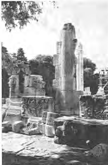
Ruins of the tragic theatre at Arles, Provence. Cather found the theatre "impressive," imagining its marble columns as a "splendid . . . noble background for the toga-clad players" ( WC in Europe 174).

(1927), The Professor's House (1925), and One of Ours —books which formally exemplify the collision of cultures or present without translation different languages in tandem. Needless for me to point out, the notion of cultures jarring against each other, with the one illuminating aspects of the other, is a central and sacred tenet of much modern literature, from Joyce's use of ancient Greece to illuminate the grubby streets of Edwardian Dublin through to Eliot's employment of Sanskrit to make sense of his modern London waste land. In these early articles, we can observe not just Cather's internationalism in terms of her appreciation of Europe but her arousal in Europe as a modern American artist. She paradoxically assimilates the culture through which she moves to consolidate what will later come to be recognized as a particularly American artistic vision.