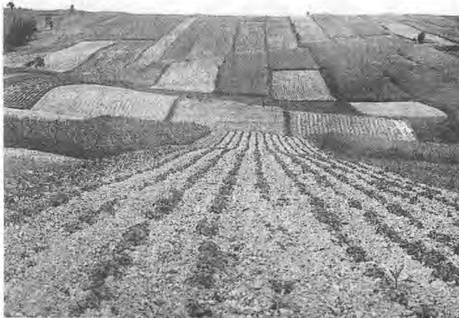
The land of Poland: a peasant countryside patterned by family-owned strips of soil.

It was this very longing for home that Mickiewicz felt. He escaped the Russian occupation of his tripartite homeland through deportation to Russia only because of his involvement in a literary organization whose ancillary political sentiments were strongly nationalistic. He was never again to return to Poland. However, befriended by several prominent Russian writers, he traveled freely and only attempted a return to Poland when a short-lived revolution, started by young men who were avid