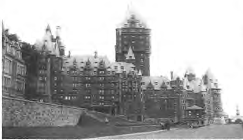
The Chateau Frontenac in Quebec City. Cather and Edith Lewis stayed at the Frontenac during their “discovery” of Quebec and on subsequent visits.