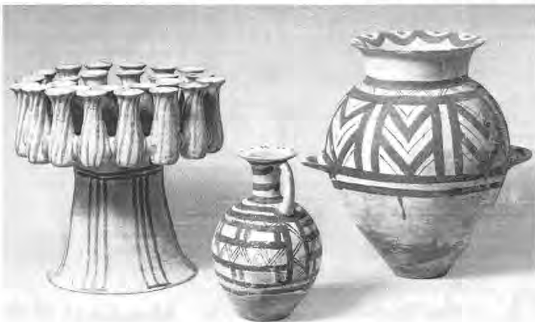
Third-century BC Pottery from the Greek island of Milos. Discovered in 1829 and taken to England, these pieces are now in New York's Metropolitan Museum.