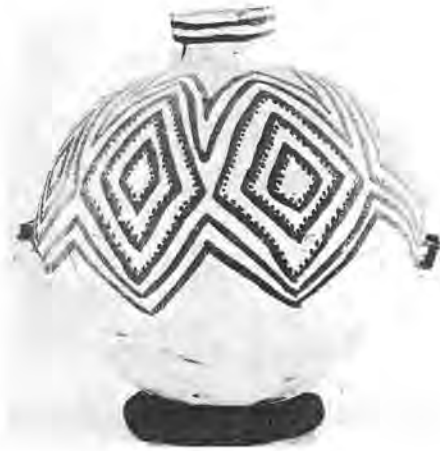
Pottery from Mesa Verde. From Gustav Nordenskiöld's The Cliff Dwellers of Mesa Verde (1893).