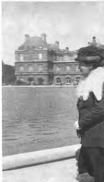
Willa Cather in the Luxembourg Gardens, 1920