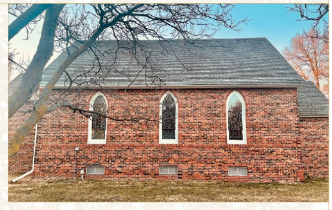
Grace Episcopal Church following the window preservation efforts.

Slowly but surely, the Grace Episcopal Church is being preserved thanks to generous donations to our Campaign for the Future . If you, too, would like to support the rehabilitation of the church, please donate online or mail your gift to the Willa Cather Foundation, 413 N. Webster Street, Red Cloud, NE 68970.